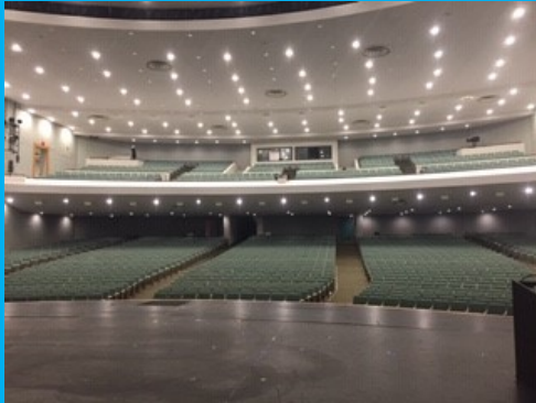
New House Lights