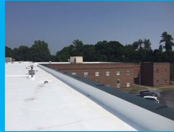
Completed TPO Roof and Parapet Cap