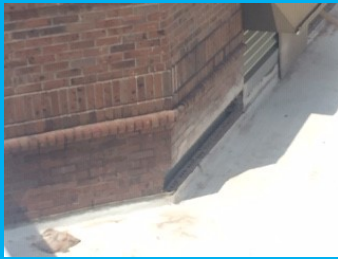
Through Wall Flashing Repair