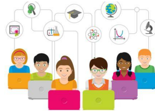
K-12 HCS Virtual Program