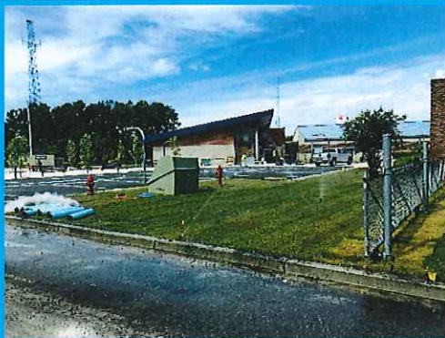
Sod & Landscaping