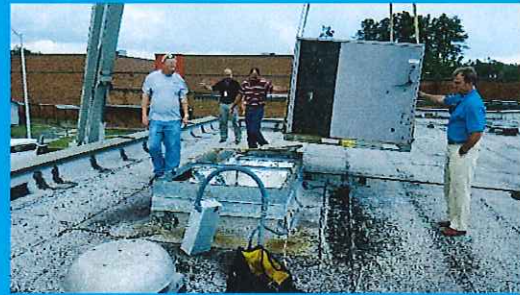
New Outside Air Unit @ Aynor Elem.