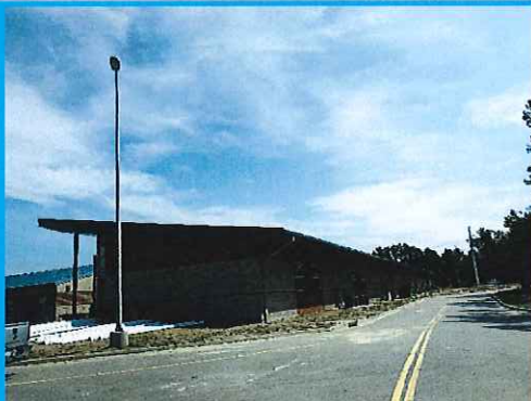
Roof and Exterior Metalwork