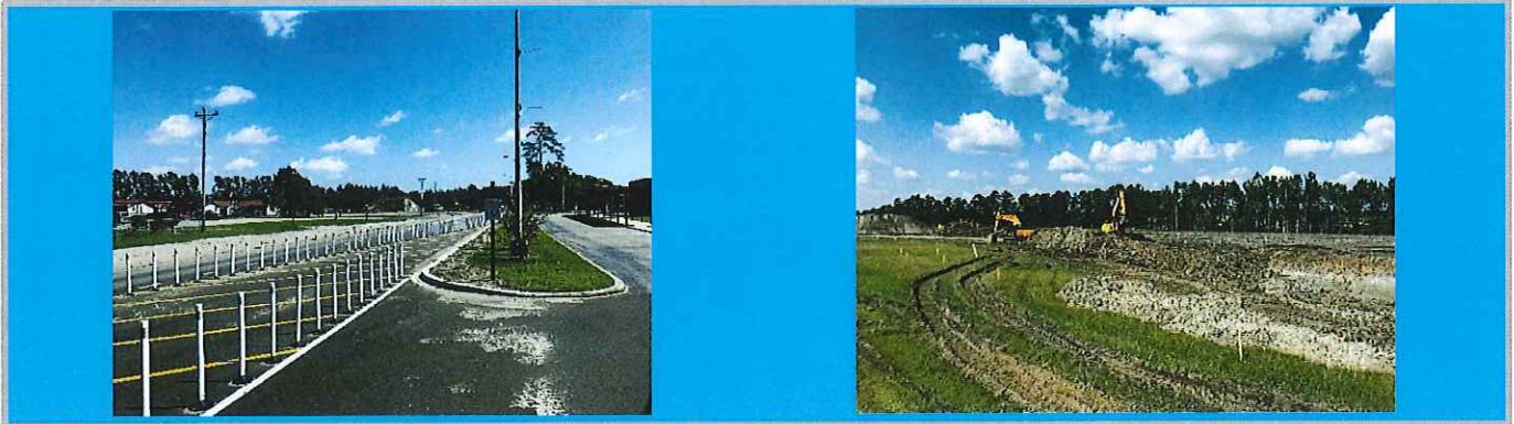
St. James Middle & Elementary – Current Entry Location