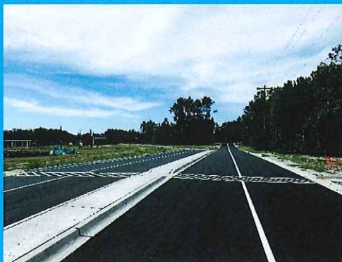
New Parent Loop from Hwy 90 Entrance