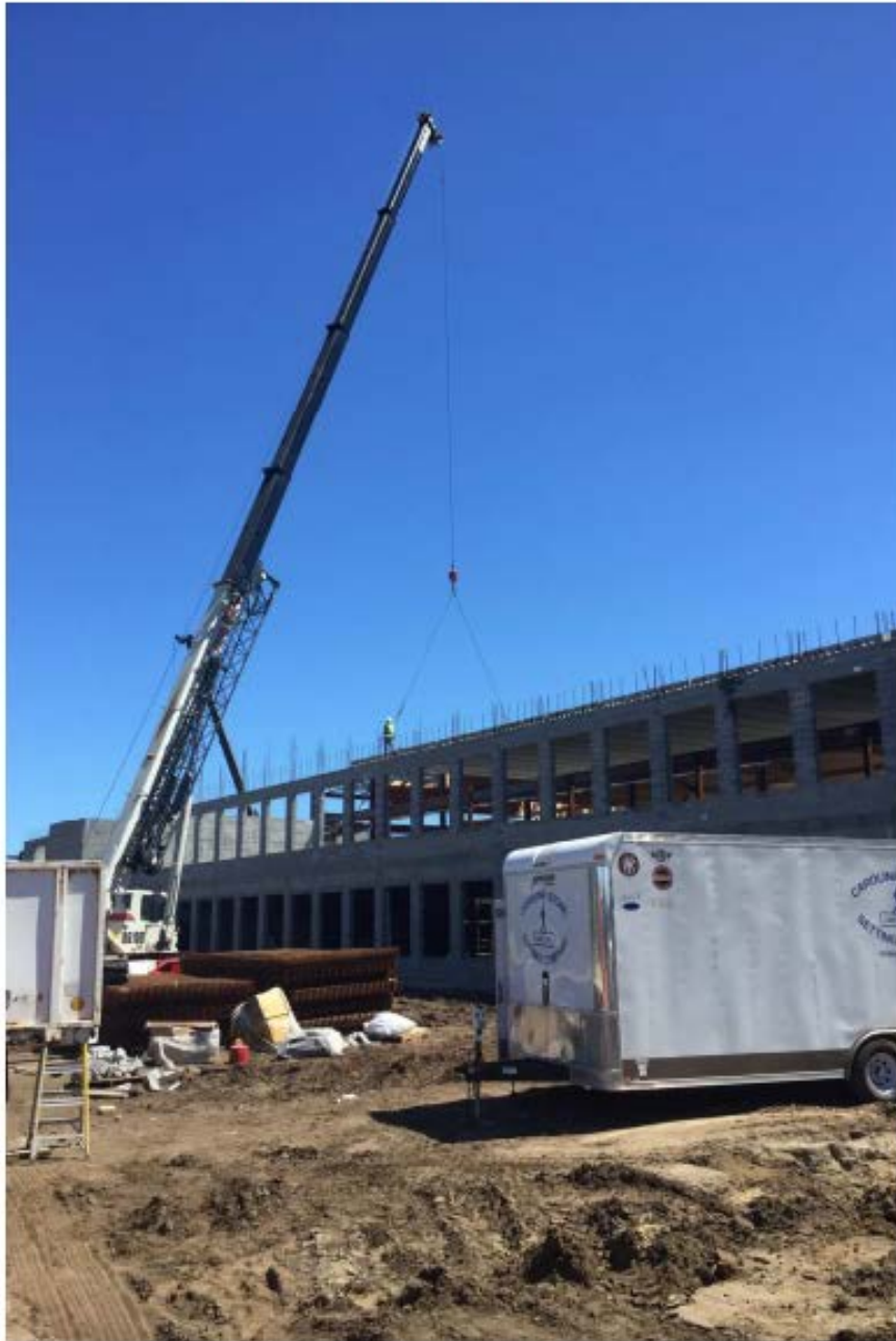
Precast plank installation