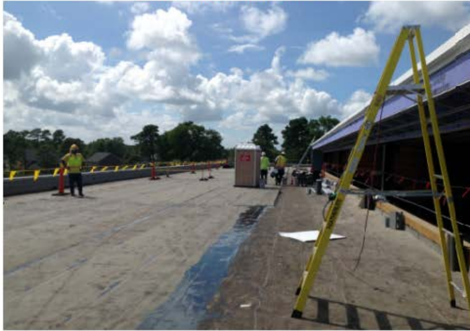
Low roof installation