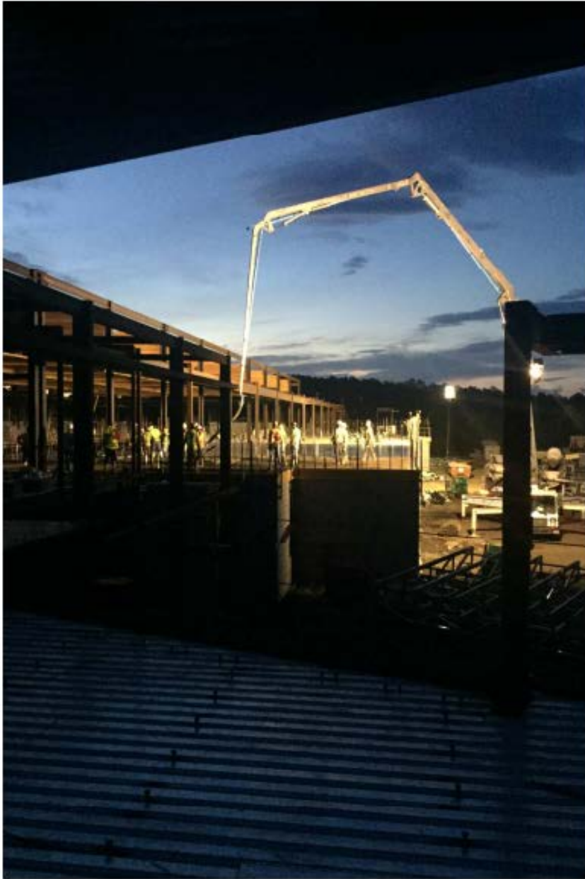
Early morning concrete pour