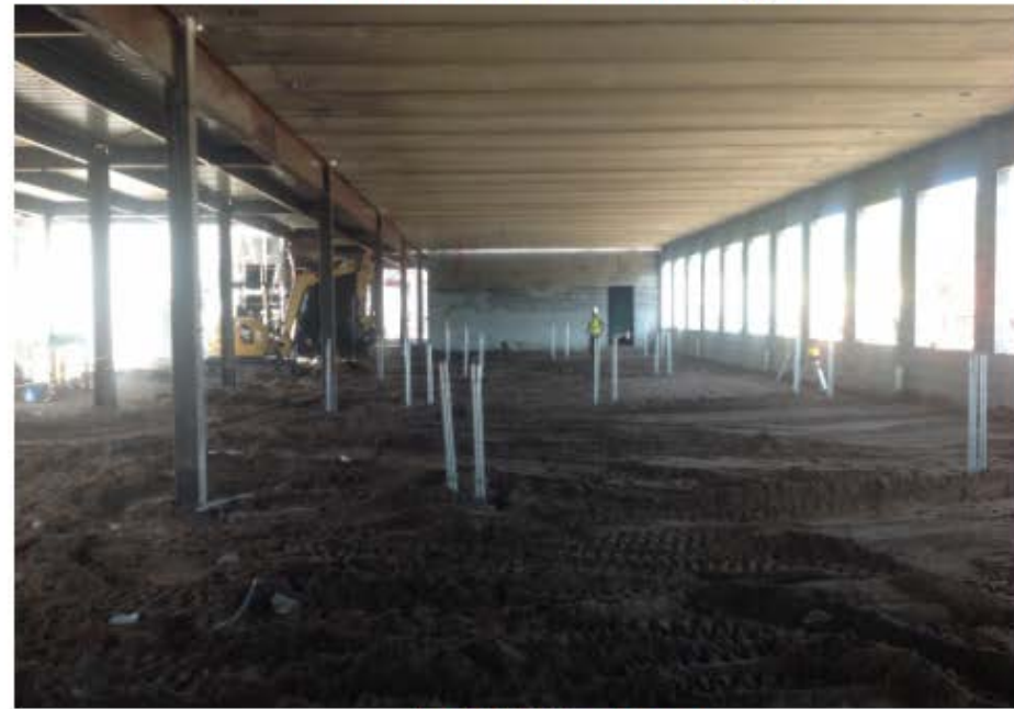
2nd FLR hallway