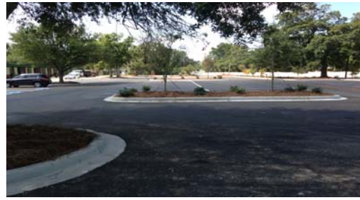
South Conway Elementary