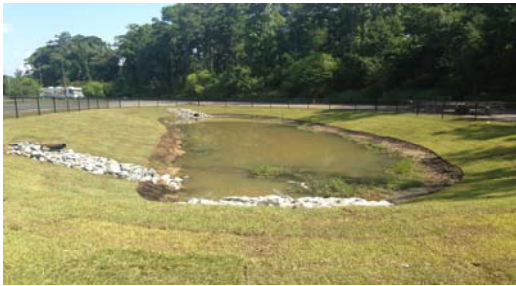
North Myrtle Beach Elementary