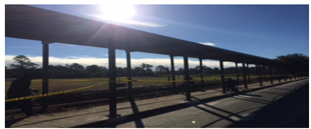
Whittemore Park Middle