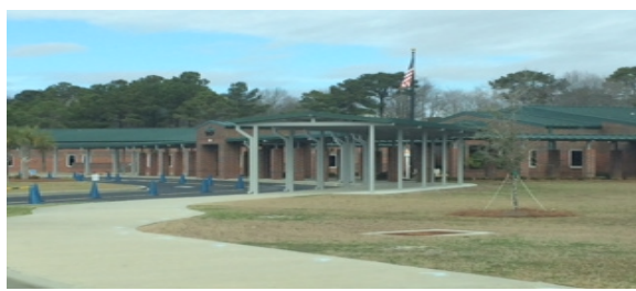
Ocean Bay Elementary