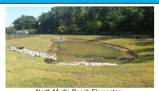
North Myrtle Beach Elementary