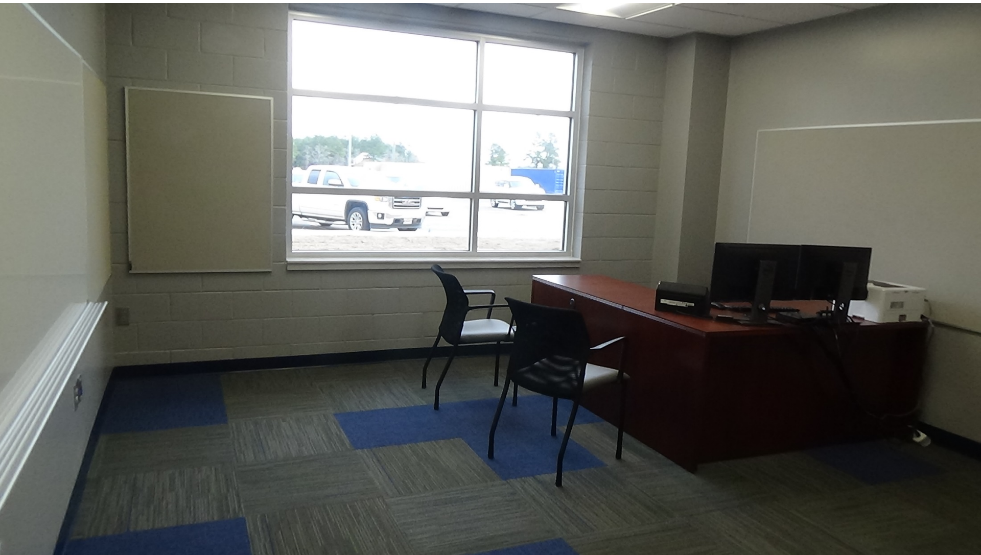
CURRICULUM COACH'S OFFICE