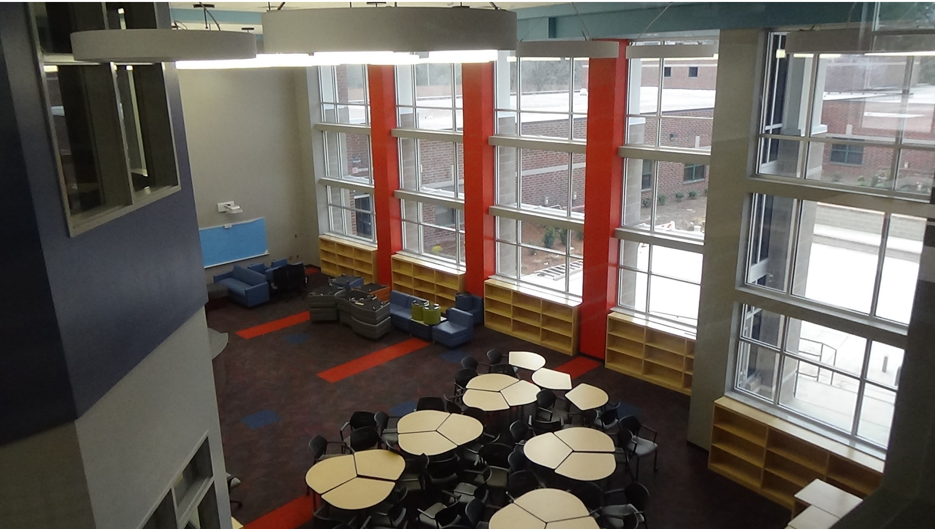
STUDENT LEARNING CENTER