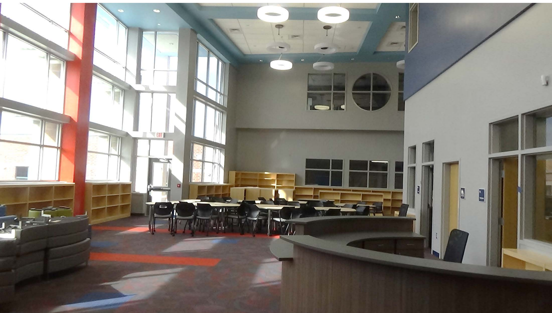
STUDENT LEARNING CENTER