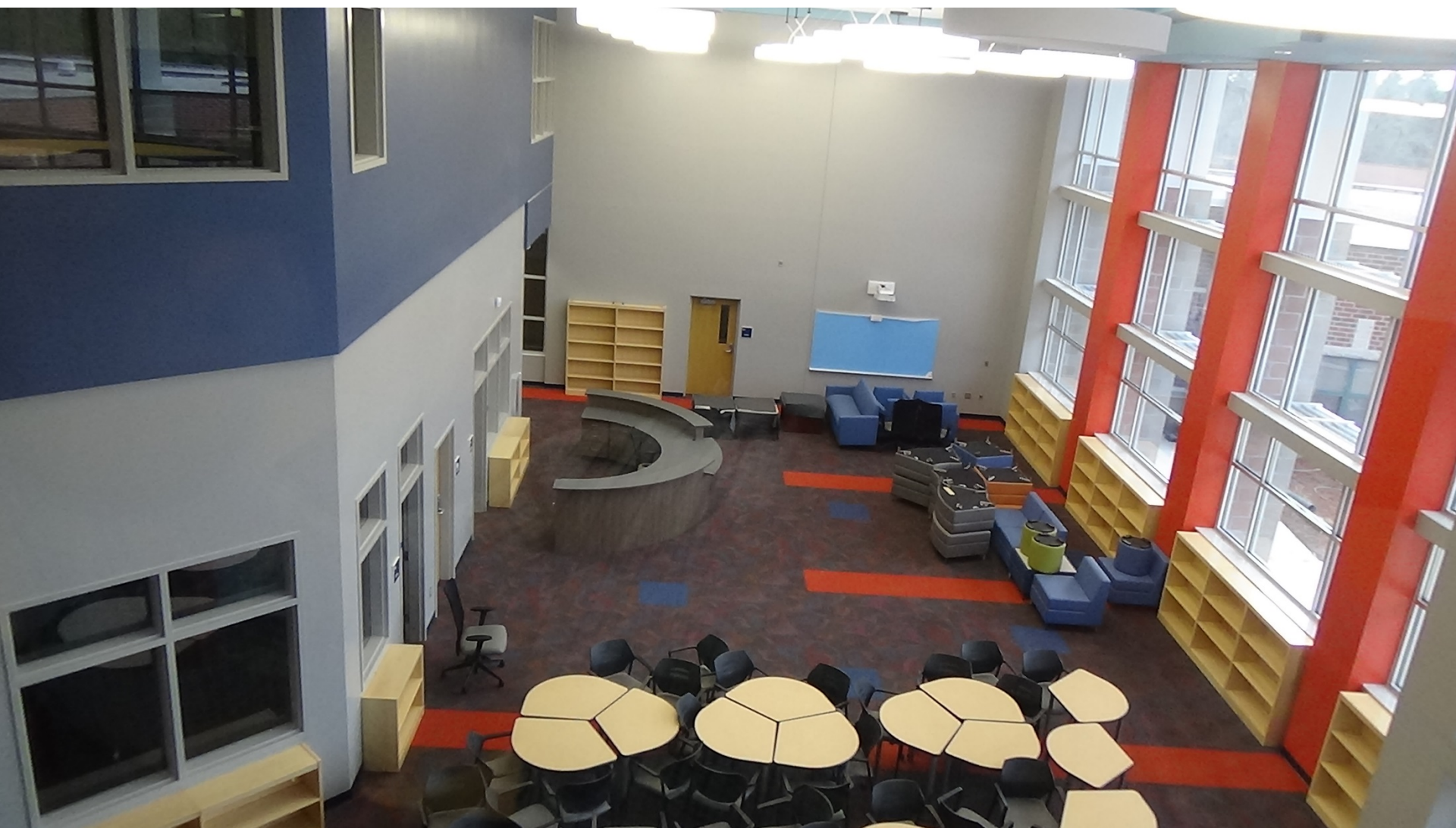
STUDENT LEARNING CENTER