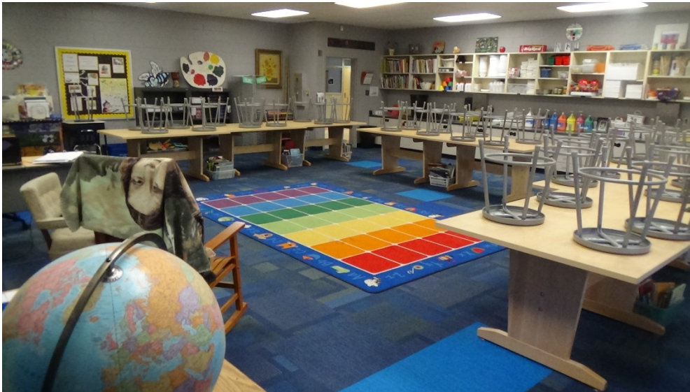
NEW FINISHES IN EXISTING ART ROOM