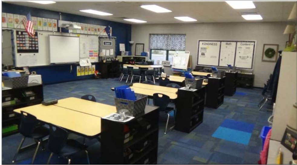
NEW FINISHES IN EXISTING CLASSROOM WINGS