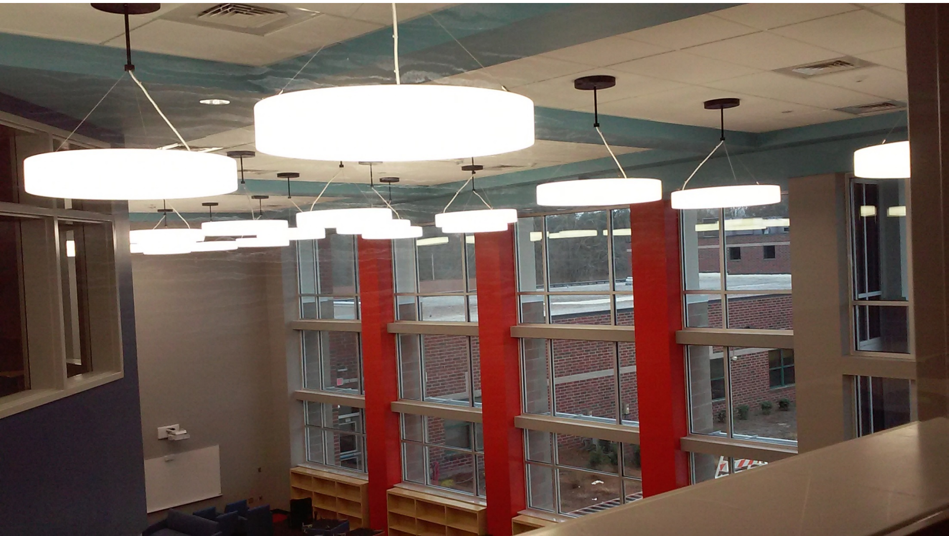
STUDENT LEARNING CENTER